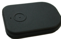
Fig. 1. ID card.

The ID card (Fig. 1) and the system unit maintains two-way radio communication on the 2.4GHz frequency band. It is recommended to replace ID card's battery every 12 months. All CR2032 type 3V batteries are suitable. The driver has been identified when person having preprogrammed turned ON ID card comes inside communication area. Hereby engine immobilization turning OFF or 'anti-carjack' cancelling has been invisible for strangers. Press the ID card button with ignition turned OFF. The system LED will inform the number of preprogrammed ID cards and the communication channel number. The number of flash packets with 5 second interval corresponds to number of preprogrammed ID cards, the number of flashes inside packet corresponds to communication channel number. The ID card is not intended for use as a key fob. It must be placed separately from car keys! It is necessary to keep ID card away from rain and snow!